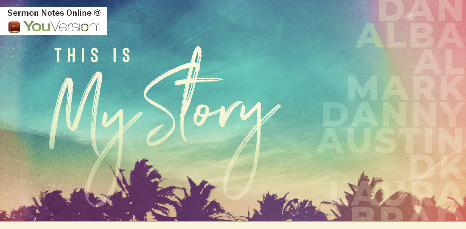
"Lacking No Good Thing" by Laura Perez